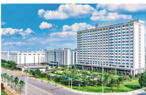
Liuyang Site / 浏阳制剂生产基地南区