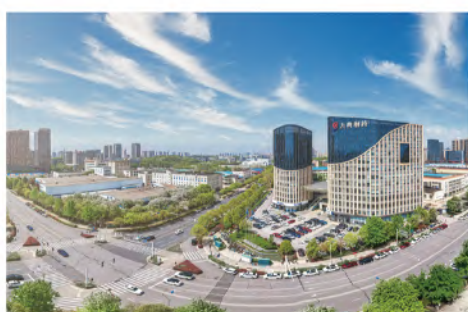
Headquarters / 总部

湖南九典宏阳制药有限公司为九典制药（证券代码：300705）全资子公司，是一家集原料药、药用辅料、医药中间体的研发、生产和销售于一体的制药企业。公司立足于规范化、专业化、精细化、定制化研发生产，构建了符合新版 GMP 的质量管理体系，配备了高端先进的仪器设备，致力于打造全球高品质原料药、药用辅料领军企业。