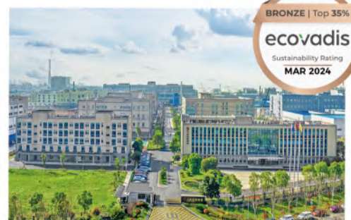
Hongyang Site / 宏阳原辅料生产基地