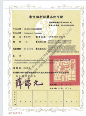
Taiwan China Certificate