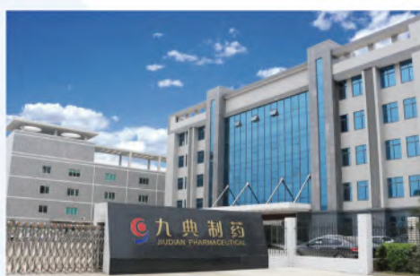
Liuyang Site / 浏阳制剂生产基地北区